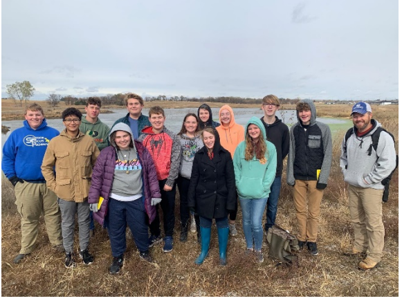
The Earth Systems class enjoyed a field trip to Salt Marsh in North Lincoln on Friday, Nov. 1